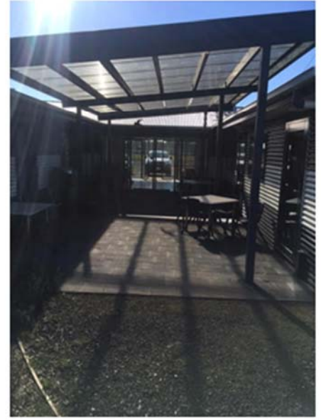
Indoor shower and toilet and undercover barbeque Area

Competitors must bring camping gear. Unpowered sites $5 per night